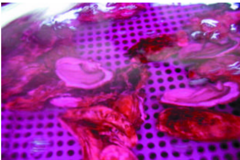
Oysters soak in cleansing liquid made pink by traces of magnesium from the salt component of ozone-nanobubble water.